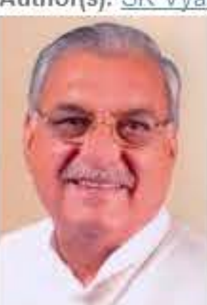
Haryana Chief Minister, Bhopinder Singh Hooda.

New Delhi, April 20, 2013: Haryana Chief Minister, Bhopinder Singh Hooda has said that Sonipat is the future city of Haryana. He said that Gurgaon, the millennium city is the face of the country and Haryana Government has a plan for developing many more cities like Gurgaon.